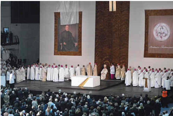
“JESUS Christ alone is the Ruler of His Church” (Beatification of Blessed Rosmini, Novara 2007)