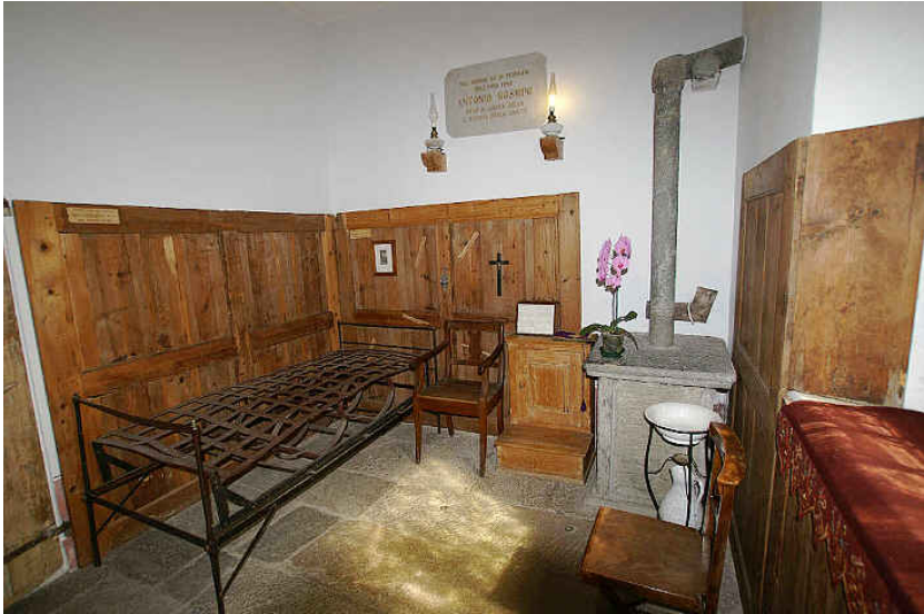
“By ourselves we are incapable of doing any good but with Christ we can do all things” (S. Monte Calvario, Blessed Rosmini’s Room)

They will reflect that continual occupation is in a special manner required of those who profess to lead a perfect life, because by such profession they resolve to attend immediately, and solely, and as much as possible, to the service of God, dedicating to it their whole time and strength.